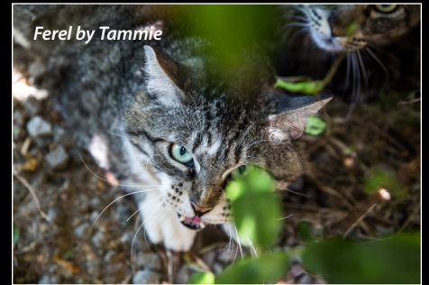
Feral by Tammie