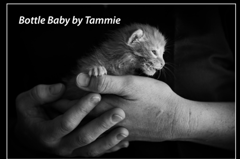
Bottle Baby by Tammie