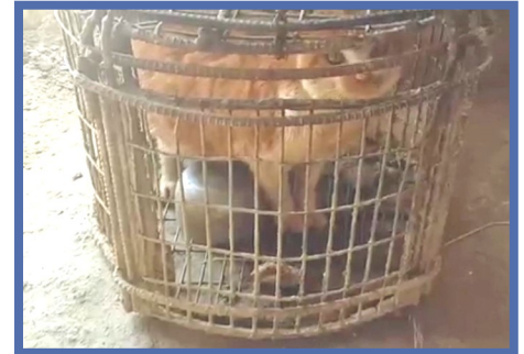
Yalu as found in Korea.

After a thorough assessment SF SPCA, behavior specialists felt Yalu had the potential to flourish in our environment (learn more about our partnership with SF SPCA on pg. 2). We transferred Yalu to FieldHaven with the intention to give him lifetime sanctuary in the highly anticipated 2nd Chance Feral Ranch (coming soon).