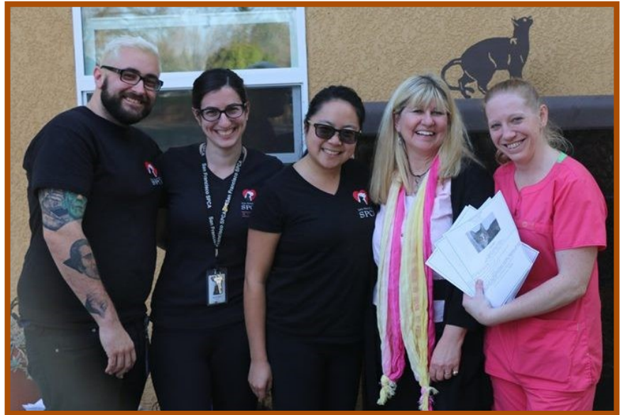
SF SPCA team coordinating with FieldHaven to find the best placement for cats from each shelter.

Animal shelters across the globe are sharing resources and developing partnerships with one another with the common goal of placing more animals in homes. Shelters in large cities tend to place most animals in smaller homes and apartments; where as, shelters in more rural areas frequently place animals in larger indoor/outdoor environments. Some outdoor living spaces include areas where a cat can be a successful barn cat. When we received a call from the San Francisco SPCA looking for indoor only cats we were thrilled to partner with them.