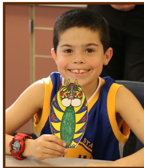
Antelope Creek student proudly shows off the a bookmark used for the FieldHaven fundraising.