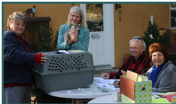
Volunteers coordinating SNAP (Spay Neuter Assistance Program)