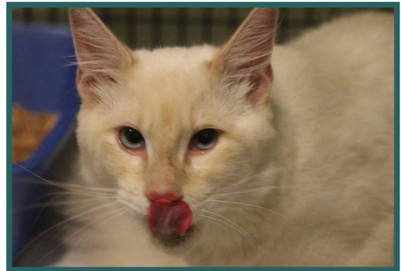
Aptly named kitty “Penthouse” after his rescue and a hearty meal!

The relieved cat turned out to be a very affectionate nine month old longhaired Flame Point Siamese. Safely back at the shelter he happily ate a bowl full of food, drank a lot of water and promptly fell asleep. Once he had gone through the FieldHaven veterinary protocol he was put up for adoption. It didn’t take long for someone to fall in love with this handsome boy. Now the kitty, aptly named Penthouse, has a wonderful family and a home of his own.