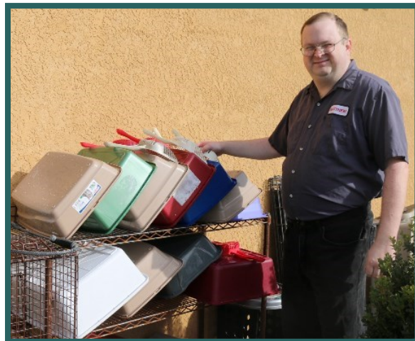
Nonstop cleanup always needed and very much appreciated