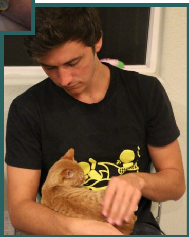
Love and purr-therapy are critical each and every day