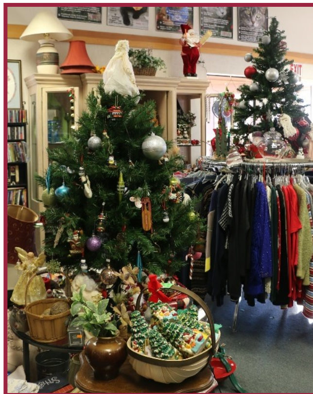
Snap It Up Thrift Store 590 McBean Park Drive, Lincoln, CA