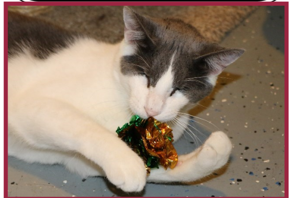
Champy of “Champy’s Catfé” fame hopes everyone will visit his Catfé this Holiday Season!