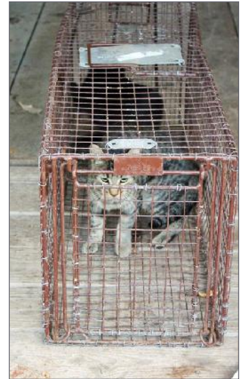
TNR—Feral cats ready for spaying or neutering

SNAP Spay Neuter Assistance Program FieldHaven's program providing free or low cost spay, neuter, vaccination and transportation services to the public.