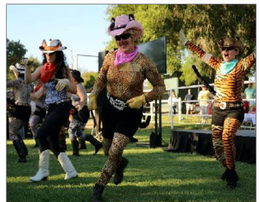
Our very own fabulous FieldHaven Ferals entertained all throughout the Live Auction.