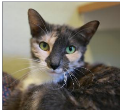
Each and every FieldHaven Kitty thanks all who participated in this great event.