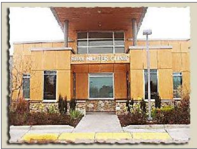
ASN—Sacramento Animal Spay and Neuter Clinic

Sometimes there just aren't enough hours in the day to say a whole word. That's why so many people use abbreviations so willingly. Many people talk about 'quotes' instead of 'quotations' and 'info' rather than 'information'. And then there is the acronym, an abbreviation formed from the initial letters of other words and pronounced as a word, like KISS meaning Keep it Simple Stupid. By contrast, an initialism – like OED for Oxford English Dictionary – remains pronounced as separate letters. The acronym creates one handy little word, saving the time needed to say them all individually, and giving you more time to do the important things in life like spending time with our kitties.