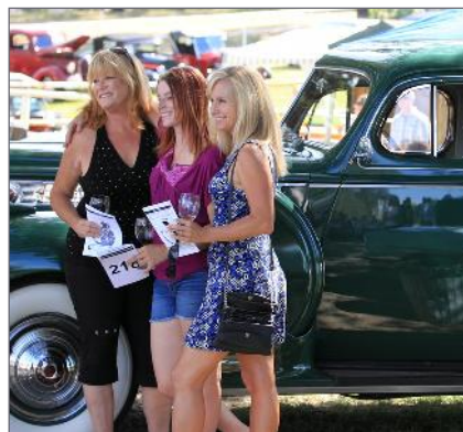
New friends, old friends and wonderful weather made for a great event.