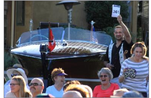
Live Auction among the beautiful oaks and exquisite classic boats.