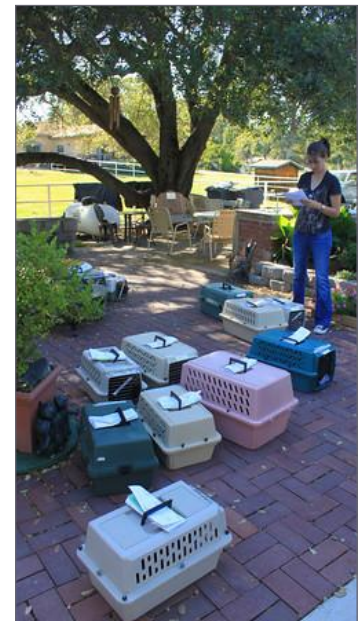
SNAP—Cats ready for transport

TLC Tenth Life Club Our program where individuals can donate funds specifically to pay veterinary expenses for severely injured cats that otherwise would not be saved.