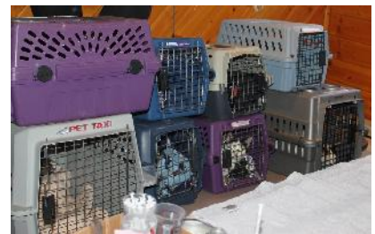
Arrival at FieldHaven