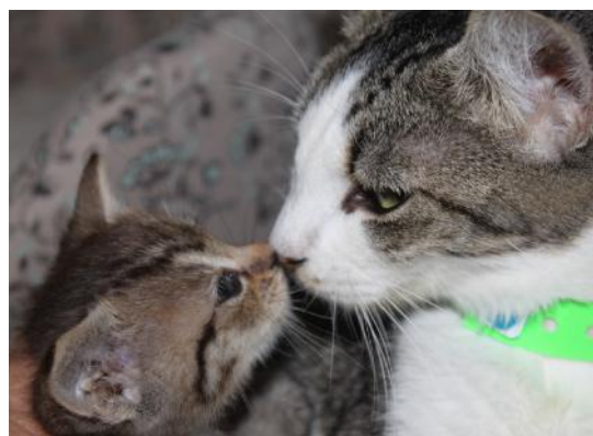
A mother's Love

Thank You from all of us at FieldHaven. We couldn't do it all without you!