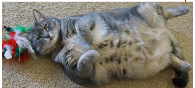
Breezy is doing so great that we can just barely fit her picture in the newsletter!