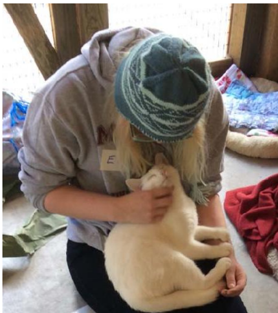
Love from Helping Hands volunteer