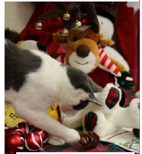
Champy at FieldHaven's SNAP itUp Thrift Store

Our upscale thrift store is always filled with quality clothing, housewares, décor, jewelry, collectibles & antiques, linens, small appliances, gardening equipment, pet items and holiday décor.