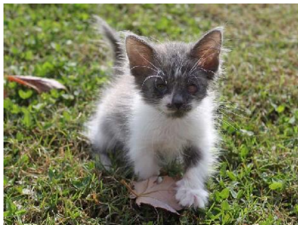
Cheerio heads out on a supervised adventure