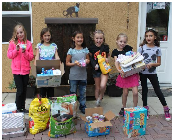
Girl Scouts with donations