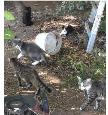
Some of the cats before rescue

Together let’s write a happy ending for these cats because on the day that each cat has found its forever home, all the rest falls away and only the love is left.