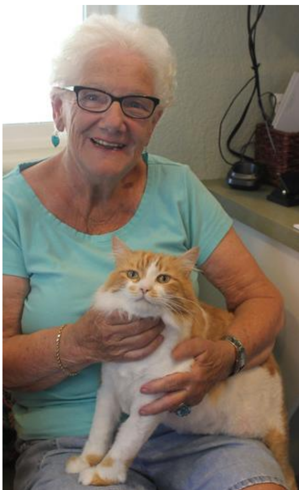
Missy is heading to her new forever home