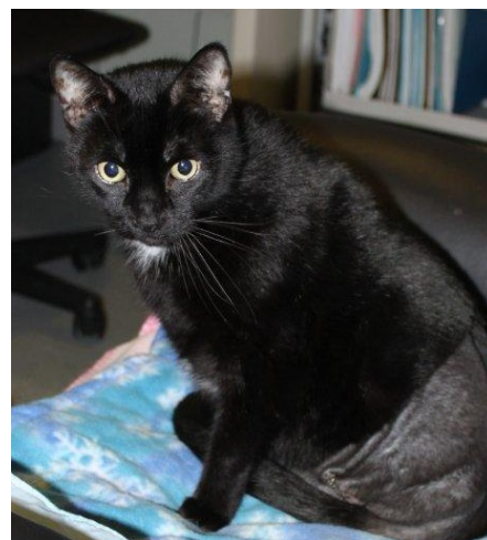
Handsome Kingsford is a lively and friendly cat waiting for his forever home.

his luck changed. After the amputation, he still scampers and runs even though he is 3 legged. Kingsford is looking for a home where he is able to sleep on the bed with you. He wants to be the love of your life because that is truly the kind of cat he is. A once in a lifetime kind