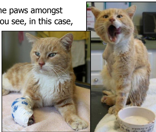
Edward on arrival and getting the last bit of a big yummy meal after surgery.