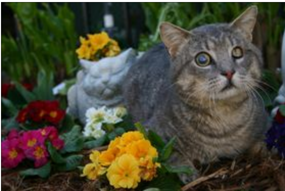
Beau, a beautiful but mostly blind cat rescued from the Lincoln Landfill, has found his forever home.