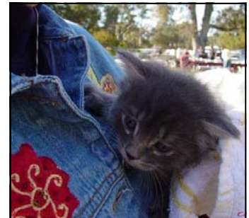
Foster parents help kittens grow up to be great cats.

This will depend on the needs of each animal. Some foster cats/kittens are young or have health issues so it is important to understand the needs of each foster cat/kitten and how much time you have available. We can match you up with the appropriate foster cats/kittens depending on your time. Time required also depends on the number of animals fostered. The length of