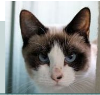
I am Nikki—a shy and beautiful girl just waiting for my forever home.