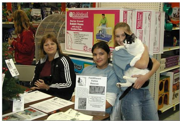
FieldHaven in the community.

We are very active in the community promoting the “FieldHaven Message” No more unwanted pets!