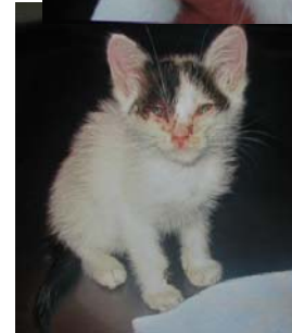
Justice upon arrival at FieldHaven (bottom) and one month later (top). What a transformation!