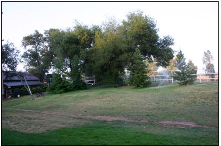
Proposed site for the new FieldHaven Shelter building. This site is near the existing cat trailer

What started with 2 people "cleaning up" one small colony of cats through TNR has blossomed into a force of 125+ volunteers who work throughout Lincoln and surrounding areas to help animals and people. We have assisted approximately 2500 cats since 2003 representing a taxpayer savings of nearly $850,000 from animals not going to Placer County Animal Services. And, most importantly, thousands of lives saved and enriched.