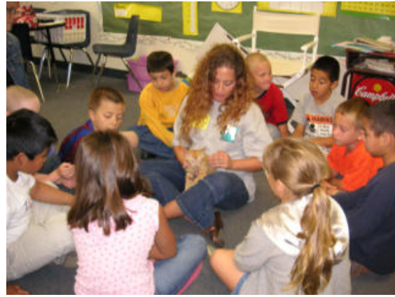
Our community outreach programs include visiting schools and teaching young people about responsible pet ownership.

At FieldHaven we are targeting the root of pet homelessness. We cannot stop the pet population problem just by placing homeless pets. Instead we reach toward the lofty goal of an enlightened and responsible public who will spay, neuter and care for all animals. Each person won over is a victory!