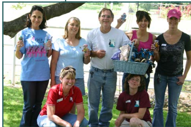
Below: At the 2008 Volunteer picnic