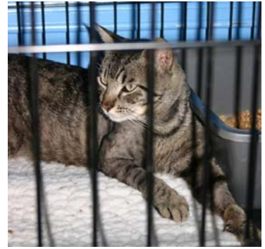
Above: Samson in recovery after surgery to remove shotgun pellets from his leg.

Can you imagine one kitty being shot by someone awful and the other kitty being rescued from a rabbit hole! What a combo!