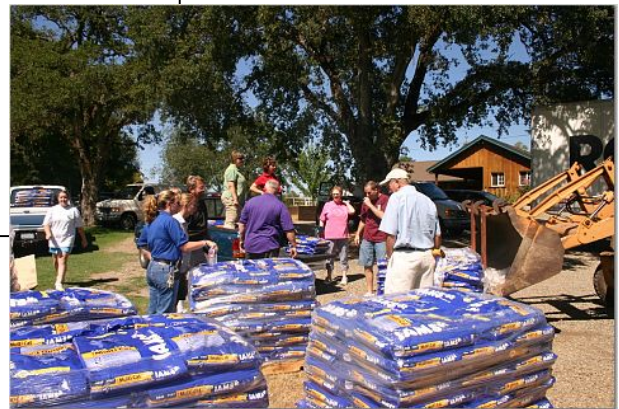
Distributing pallets of Iams cat food awarded to FieldHaven for Excellence in Execution on the "Home For The Holidays" Campaign. Ten TONS were delivered in 2 tractor trailers.