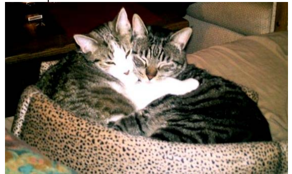
Below: Snuggling with adopted brother Sneakers, who was found living in a Lincoln park rabbit hole by a FieldHaven volunteer.