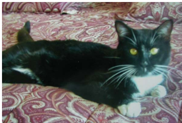
Sebastian lounging in his “palace” after living the feral life in Lincoln.