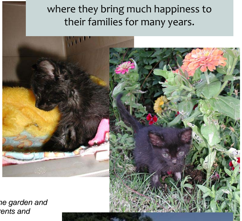
Clockwise from top: Kitten Deke home from ICU, in the garden and with his proud new parents. Adult Dekey with his parents and lounging at home.

Deke's story really illustrates FieldHaven's mission – helping the community by partnering with business and people to address cat issues, save feline lives and then send cats and kittens on to homes where they bring much happiness to their families for many years.