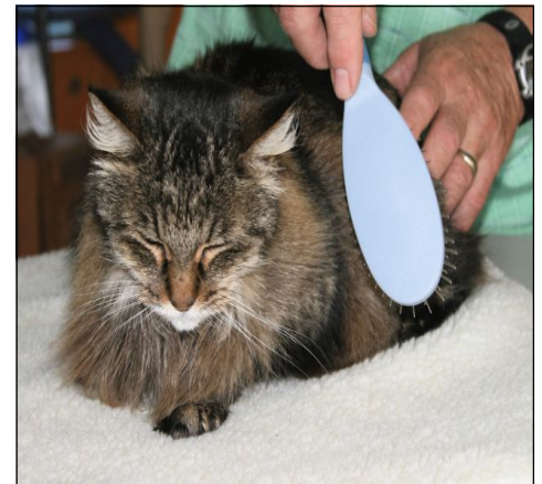
Daisy loves her Full Body Massage

Full Body Massage - Using a variety of brushes (depending on what our client prefers), our Masseuses brush out loose hair and mats while providing a soothing, gentle skin massage that's sure to make any kitty purr.