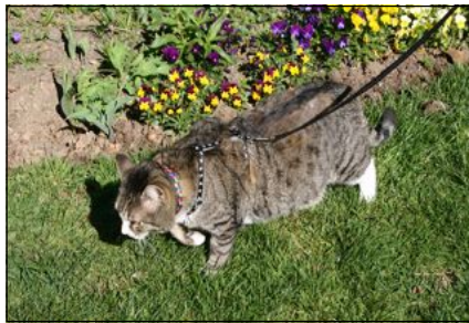
The garden is full of exotic sights and smells to make exercise fun for Dogma