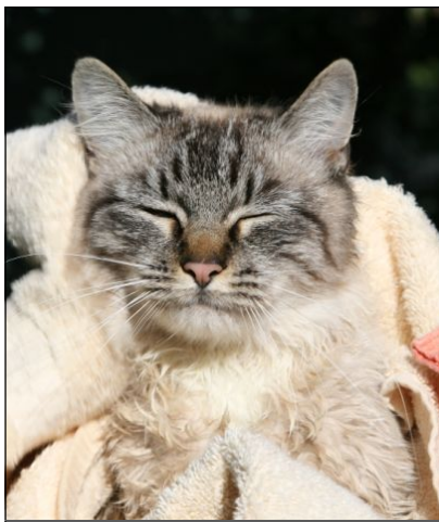
Heidi's Herbal Body Wrap

We take the health, beauty and happiness of all our kitties very seriously. FieldHaven staff, volunteers and veterinarians spend days, weeks, and sometimes even months caring for each client from the time they come in until they